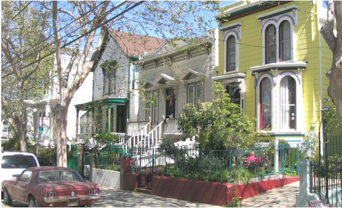
East side of Shotwell Street between 21 st and 22 nd Streets.

Boundaries: Shotwell Street between 20 th and 25 th Streets, as well as portions of South Van Ness Avenue and Folsom Street