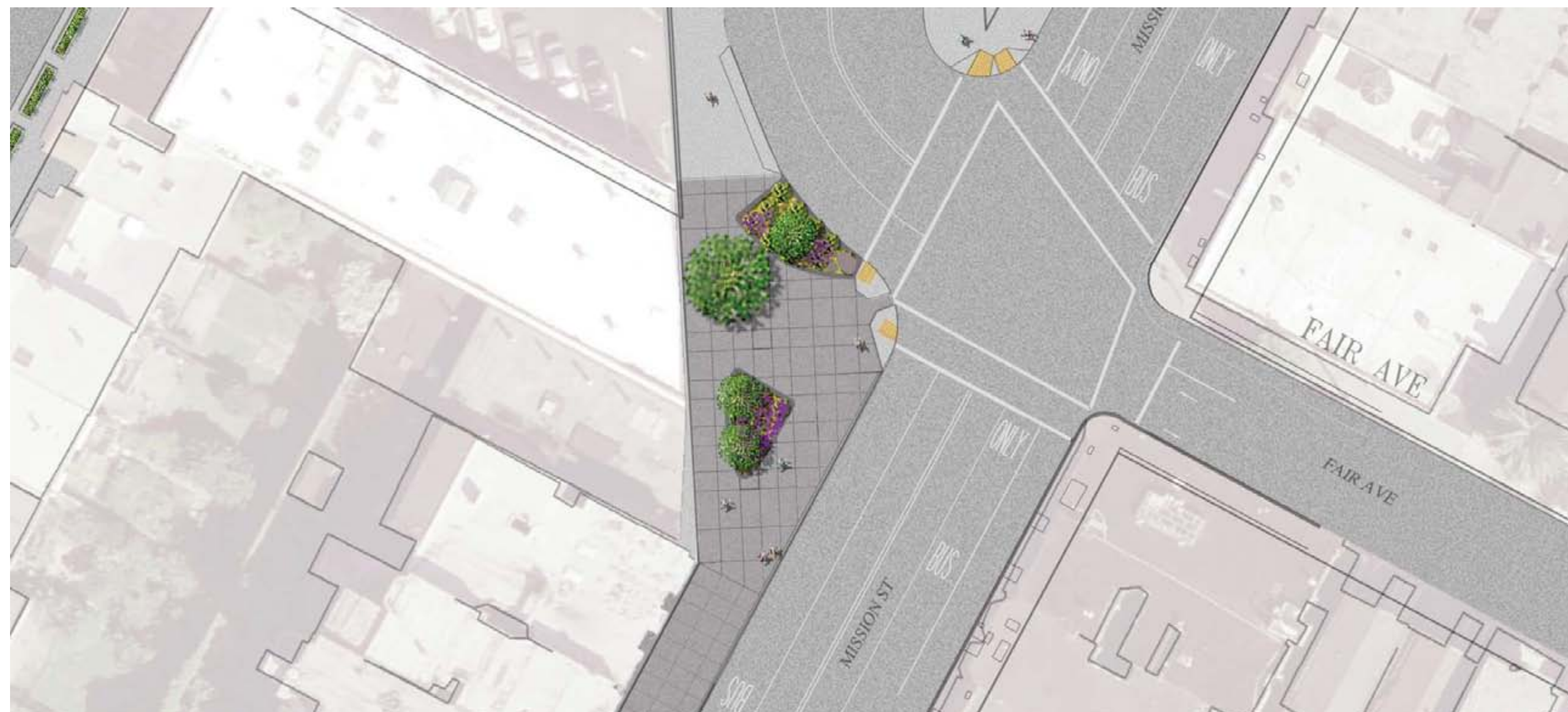
Plan and view of the new Green Gateway plaza at Mission and Valencia intersection.

What organizations could we partner with?