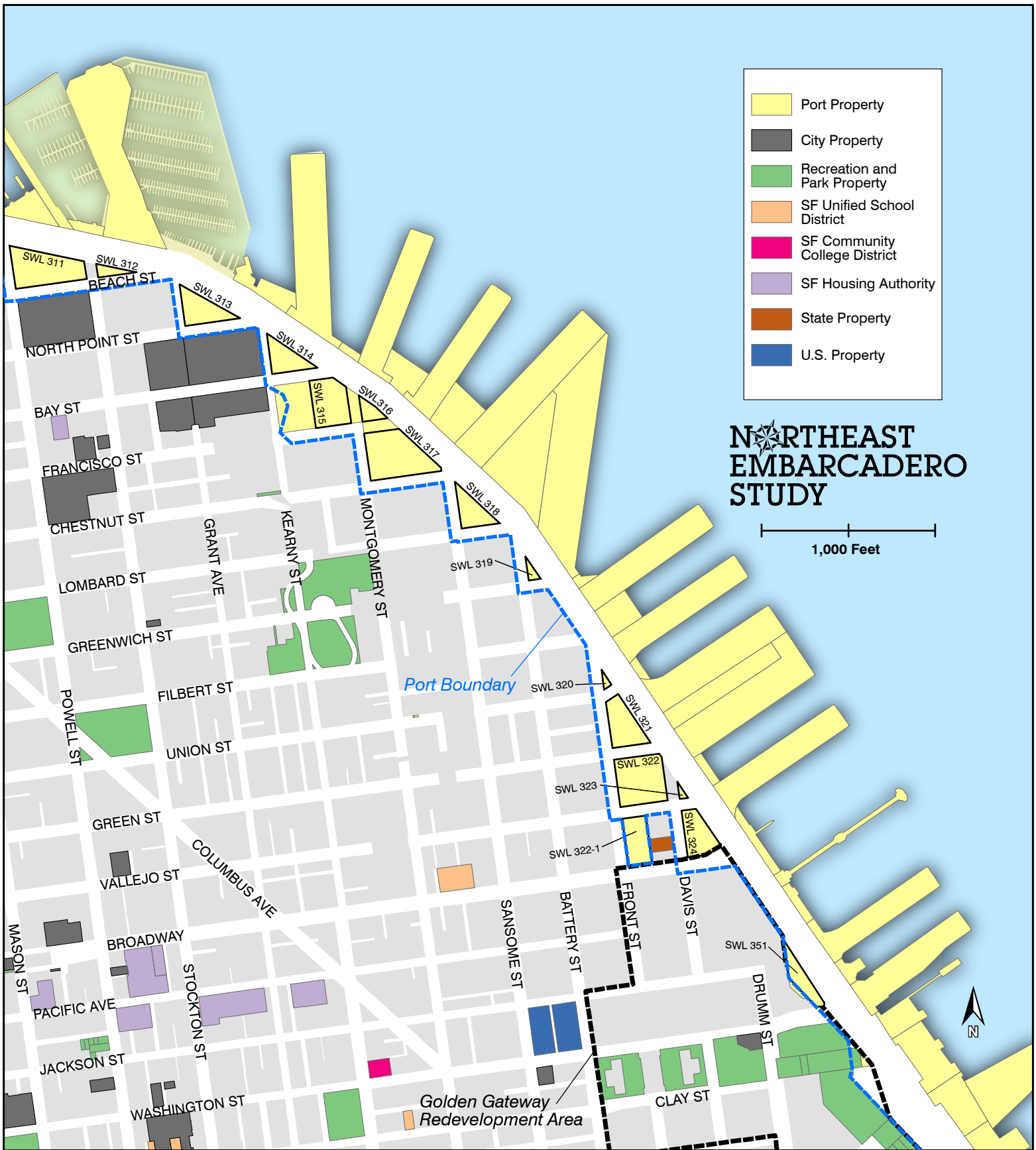
Jurisdiction of Public Property